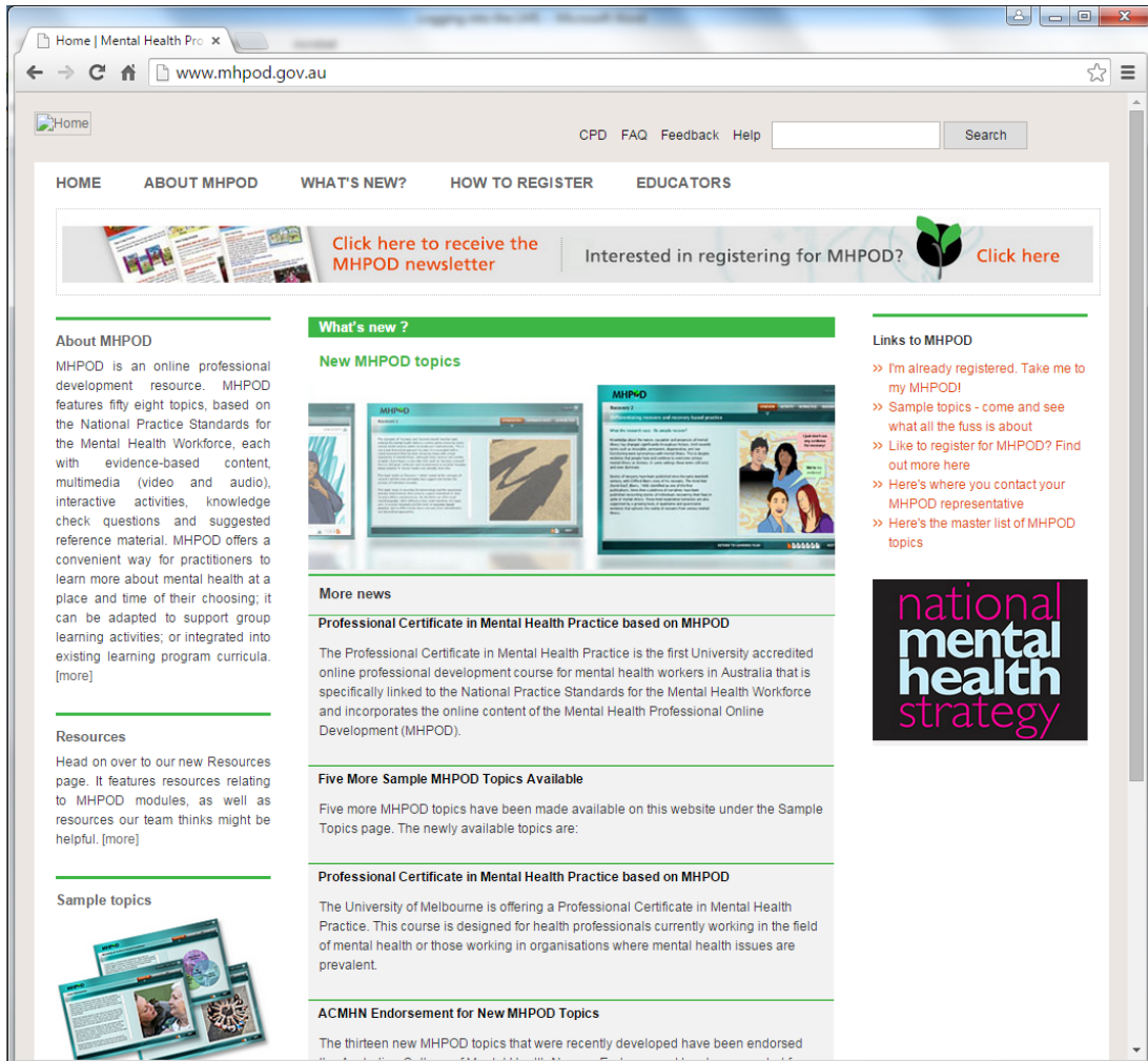
Figure 2 – MHPOD national website - www.mhpod.gov.au