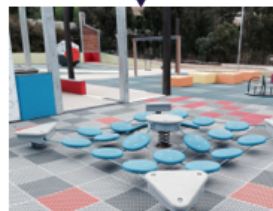
Safety mats made from recycled PVC in Sherbrook Park, Maroondah City Council

To receive this publication in an accessible format phone 03 9096 2119, using the National Relay Service 13 36 77 if required, or email Sustainability <sustainability@dhhs.vic.gov.au>