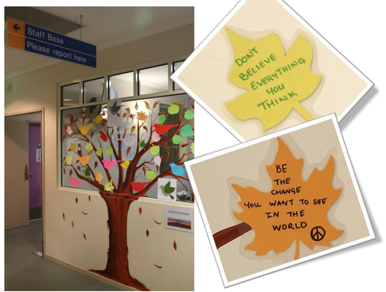
Bendigo Health, Victoria