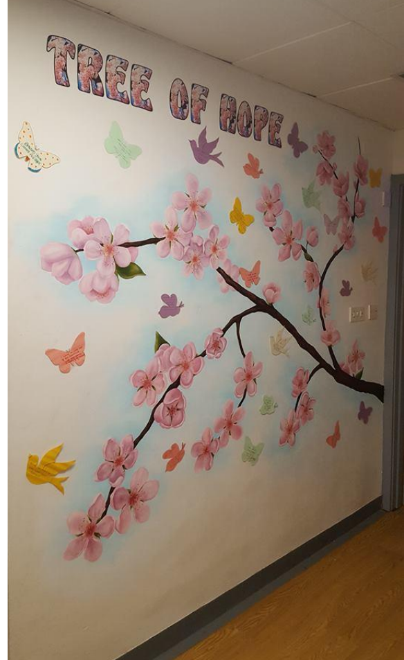
Shared on Facebook, organisation not specified