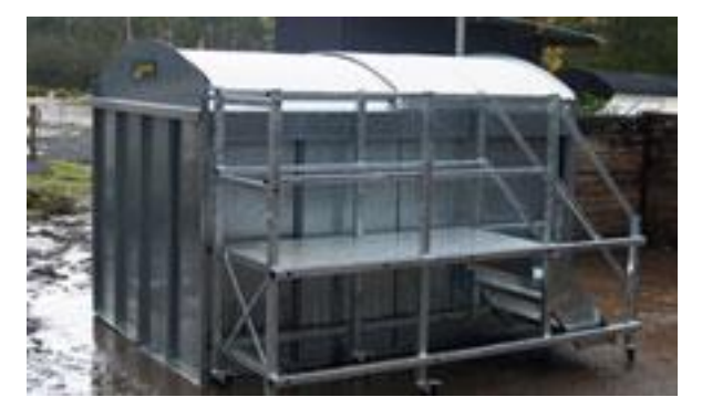
Figure 3: Worm farm at Healesville Sanctuary, Zoos Victoria

How it works: A worm farms uses a mix of worms (not just the kind found in your garden), and concentrates them in a lidded container with the food as feed and a drainage outlet for the worm juice. Typical worms are: red wrigglers, white worms and earthworms. Worms will gradually multiply to meet