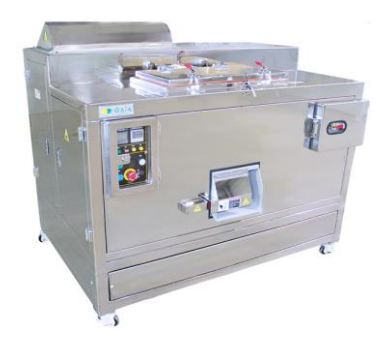
Figure 5: A typical dehydration unit for 50 kilograms per day

Removing moisture by dehydrating food waste results in a lighter load of dry biomass that is good for composts, gardens or incinerating to generate energy. Dehydrator units are an enclosed container that uses electricity or gas to heat and operate a motor that agitates the wet mix, while a fan removes moist air from the chamber. The heat, agitation and air flow cause rapid drying within 24 hours and a major reduction of around 90 per cent in both volume and weight. The finished biomass is not compost, but it is sterile and pasteurised. Dehydrators are good for both food and garden organic material.