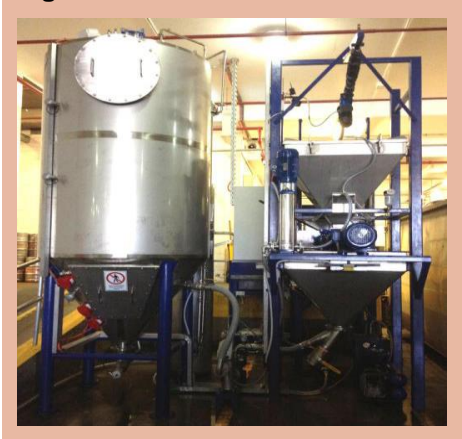
Figure 7: Anaerobic unit at Federation Square

Typical food organics used for this unit at Federation Square includes salad, vegetables, chicken fat, brines, fish waste, pastries, coffee grounds and fried food. When the load is ready, the lid opens on the receiving tank, food waste is tipped in, and the macerator starts. Shredded food waste collects in the balance tank and the transfer pump pumps feedstock into the reactor tank. Gas is collected at the top of the reactor tank and supplied to the boiler.